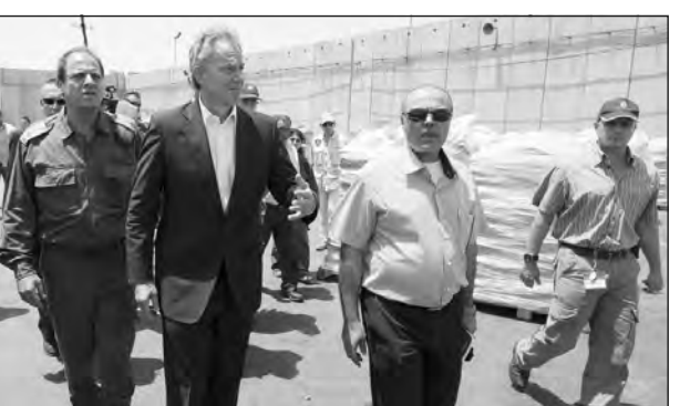
تونى بلير مبعوث اللجنة الرباعية الدولية خلال تفقده معبركرم ابو سالم