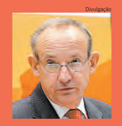
YVO DE BOER A COP-16, em Cancún, pode completar o acordo climático que não foi fechado em Copenhague